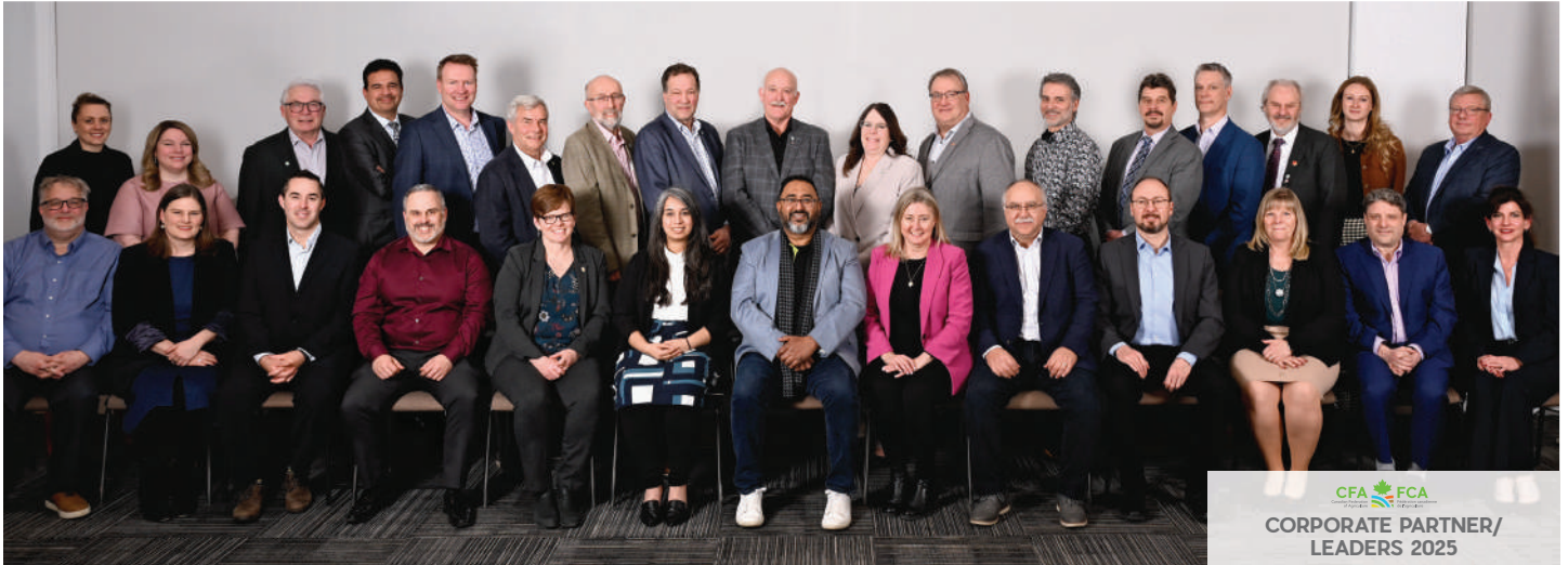
*2025 Corporate Leaders/Partner Photo – CFA AGM