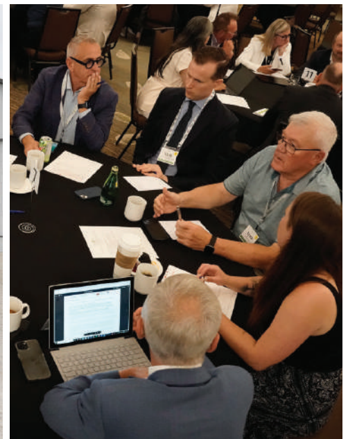
Summer Meeting 2025

We anticipate approximately 200 of the most influential Canadian Agriculture industry stakeholders at this much anticipated event. Your contribution, support and participation to this prestigious event is a valuable investment in the long-term growth of the agriculture sector.