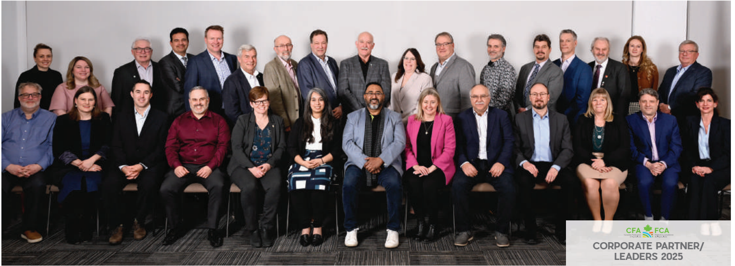
*2025 Corporate Leaders/Partner Photo – CFA AGM